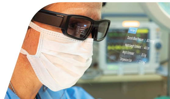
Immediate mobile access to patient data & tests