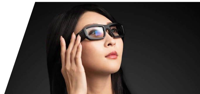
Operate the Vuzix Blade with your voice or the built-in touchpad for silent control

The Vuzix Blade are the first Augmented Reality (AR) Smart Glasses featuring advanced waveguide optics for hands-free mobile computing & connectivity.