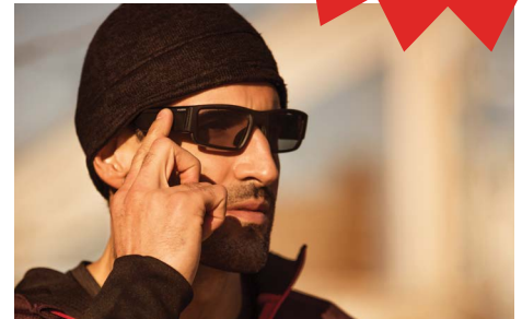
Receive work instructions on the job