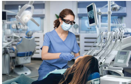
Real-time, hands-free information